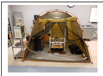
Figure 2. Cushion heat and water vapor test

The test for heat and water vapor transmission properties of wheelchair cushions under simulated loading conditions is shown in Figure 2 [12]. The testing environment of 23\pm2^{\circ} C and 50\%\pm5\% relative humidity (RH) was maintained with environmental controls using an external humidifier in the tent. The water circulator was also maintained between 35^{\circ} C and 37^{\circ} C, and 200 ml of distilled water was added in a thermodynamic rigid cushion loading indenter (TRCLI). The data recording began with temperature and humidity readings from the sensors at a 0.2 Hz sample rate. At steady state, the TRCLI was applied onto the cushion. After 180±6 minutes, the TRCLI was lifted above the cushion. The