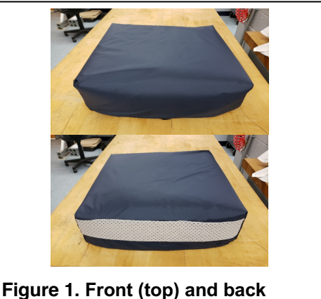
Figure 1. Front (top) and back (bottom) of the prototype

The resulting prototype uses a modified Skin IQ<sup>™</sup> (Arjo, Sweden) mattress cover for application on wheelchair seat cushions. The Skin IQ product provides a simple, effective solution to manage the skin microclimate of patients and thus help prevent pressure injuries. The system operates similar to a mattress with a traditional low air loss feature in that the outer layer of the cover is made from a vapor